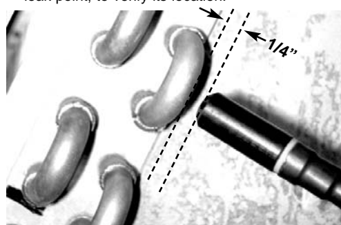
SRL8 testing an A-coil in an evaporator, 1/4" from the line.

4. Once the maximum refrigerant concentration is located, allow the meter to zero away from the leak. Then do a second sweep of the suspected leak point, to verify its location.